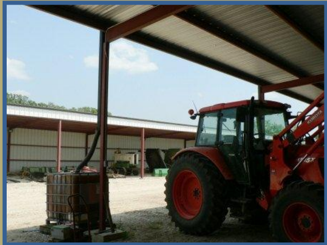
225' x 25' - 3 sided metal building for large equipment and hay storage

Additionally there are two mobile homes, which provide great weekend guest potential or ranch worker's quarters, multiple water meters are in place and one water well. A set of pipe working pens and new fencing and cross fencing throughout the ranch round out the livestock aspect of this ranch's potential.